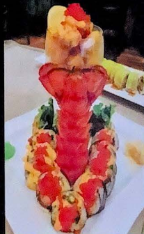
ROCKIN' LOBSTER BOMB M.P.

* Consuming raw or undercooked meats, poultry, seafood, shellfish, or eggs may increase your risk of foodborne illness